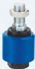
ISO-UJ 浮动接头 Float Joint